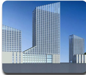
Public building insulation