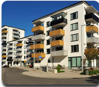
Civil building insulation