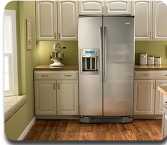
High end refrigerator